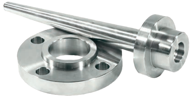
Thermowell model TW31 (lap flange, optional)