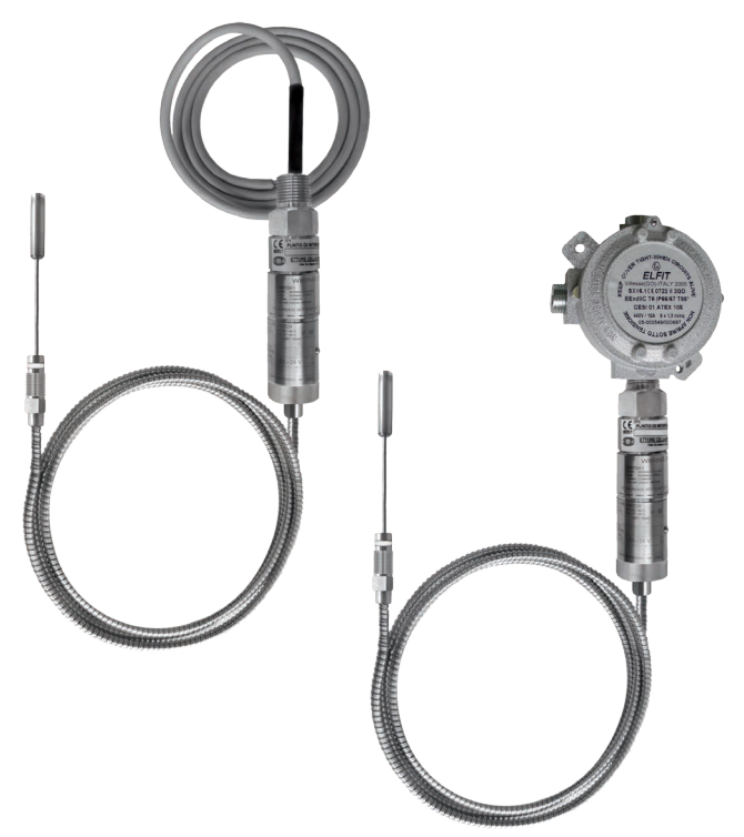
Fig. left: Temperature switch model TXS Fig. right: Temperature switch model TXS with surfacemounted junction box