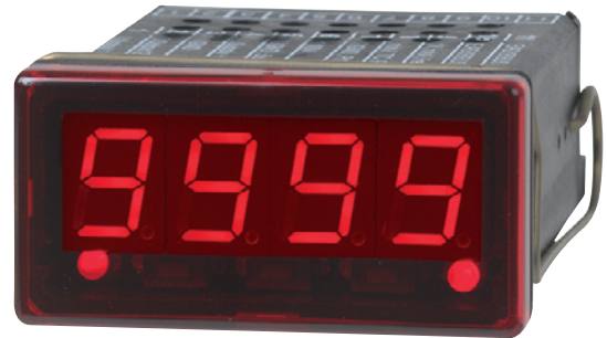
Digital indicator model DI15