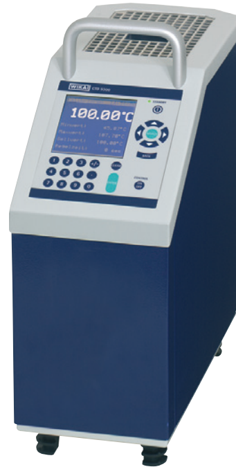
Temperature dry well calibrator model CTD9300