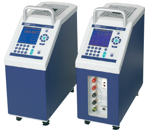
Temperature dry well calibrators, model CTD9300