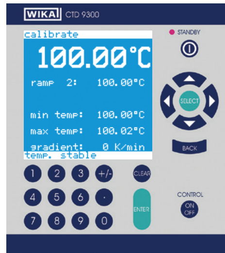
Measurement and calibration menu

With the measuring instrument, which can also be retrofitted into existing calibrators, Pt100, thermocouples and 0/4 ... 20 mA currents can be measured and converted into temperatures; and also in comparison with an external reference thermometer. Automatic calibrations are possible using a PC/laptop and the calibration software.