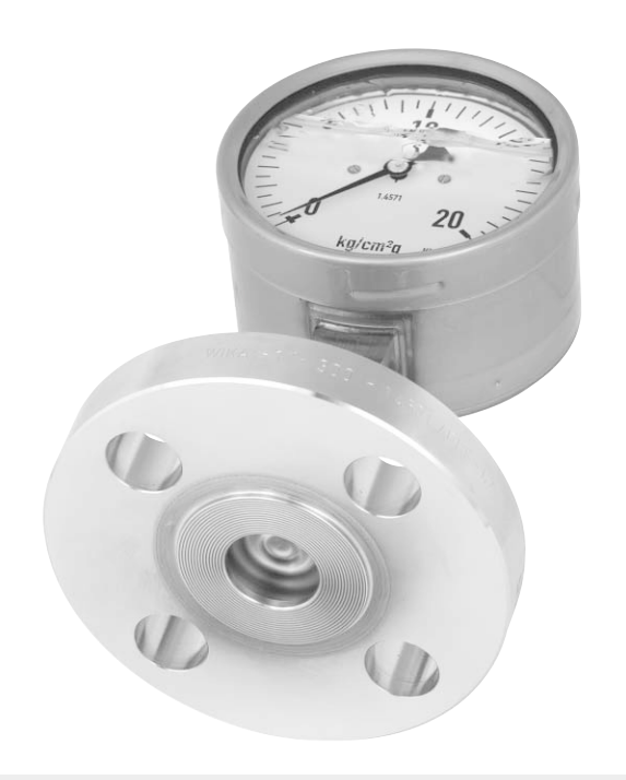
Diaphragm Seal, Flanged Process Connection Model 990.26 with Pressure Gauge Model 233.50 NS 100