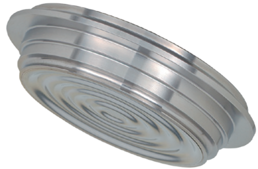
Diaphragm seal with sterile connection, model 990.24

The model 990.24 diaphragm seal with VARIVENT® connection is particularly suited for use in sterile processes